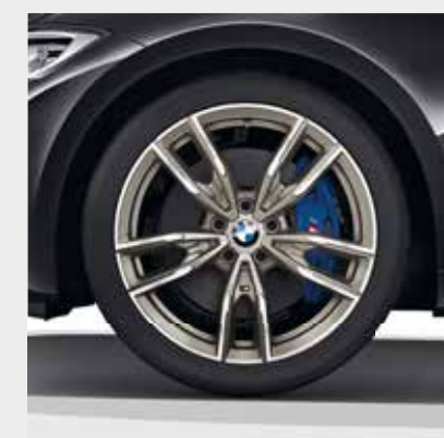
19" 792 M Light Alloy Wheels in Cerium Grey