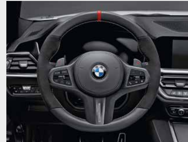
BMW M Performance Steering Wheel in Alcantara and Carbon Fibre