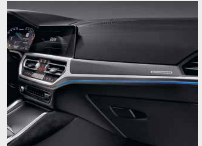
BMW M Performance Interior Trim in Carbon Fibre