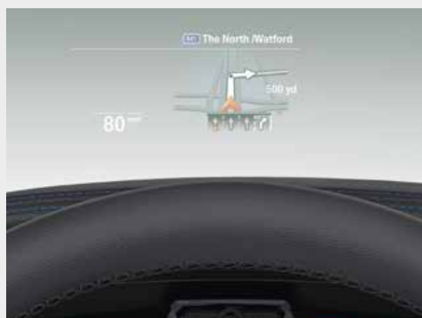
BMW Head Up Display 1