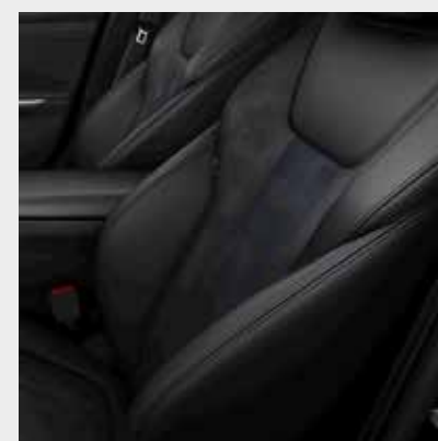
Alcantara Sensatec combination Black | contrast stitching Blue | Black

[ Colours ] The colours printed above are intended to provide you with a first impression of paints and materials available for your BMW. Experience has shown, however, that printed images of paint, upholstery and interior trim colours cannot faithfully reproduce the actual appearance of the originals. We recommend therefore that you consult your BMW partner who will be able to show you original samples and assist with special requests.