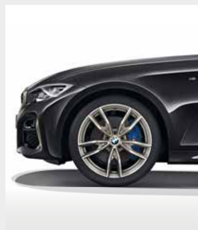
M Sport Brake