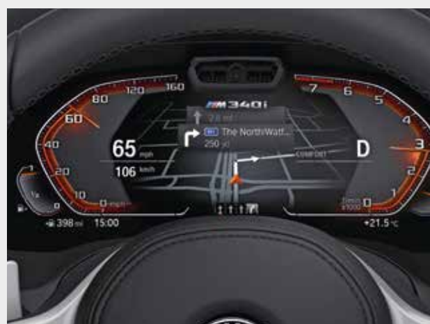
BMW Live Cockpit Professional with M340i specific display