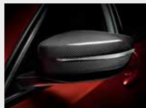
Exterior Mirror Caps in Carbon Fibre