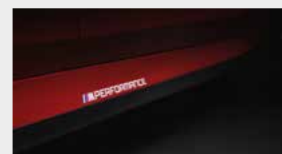
Side Skirt Transfers in Matt Black