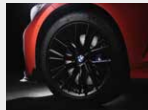
18" 796 M Jet Black Alloy Wheels