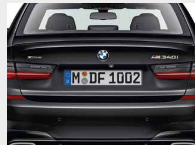
M Rear Spoiler in body color