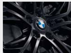
BMW Floating Hub Cap