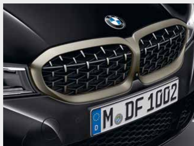
Cerium Grey Mesh Grille