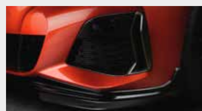
Front Attachment in High-Gloss Black