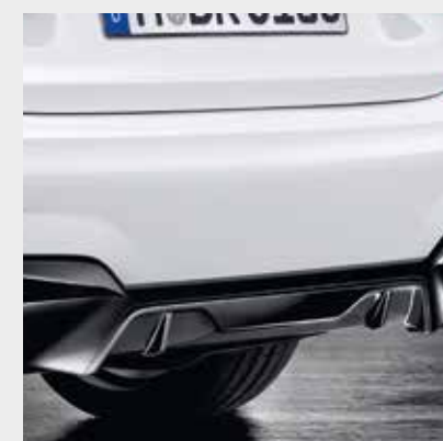
BMW M Performance Diffuser* in Carbon Fibre. Also available in Matt Black