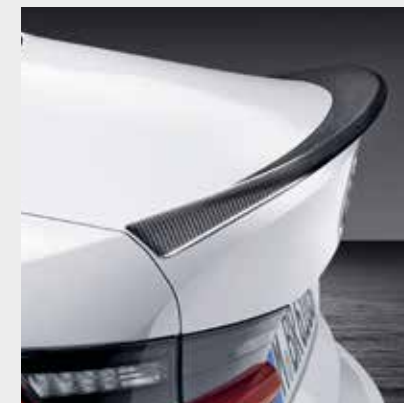
BMW M Performance Rear Spoiler in Carbon Fibre