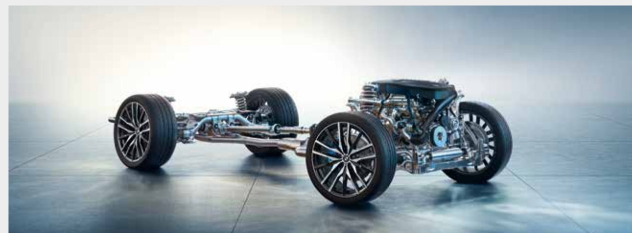
M Sport Suspension and xDrive - The intelligent All-Wheel Drive System