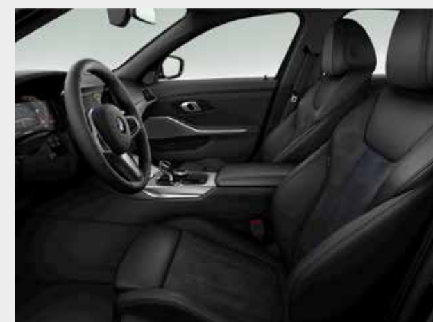
Sport Seats in Alcantara/Sensatec combination upholstery with M Seat Belts