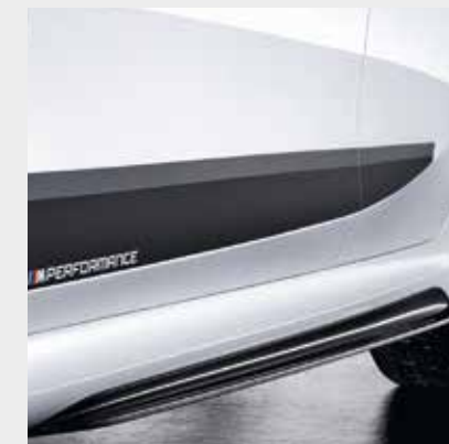
BMW M Performance Side Skirt Attachment in Black High-Gloss