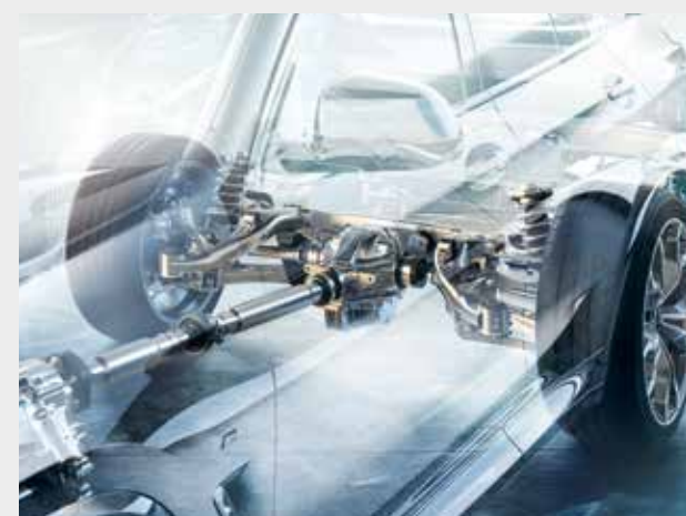
M Sport Differential