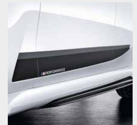
BMW M Performance Side Skirt Films in Frozen Black