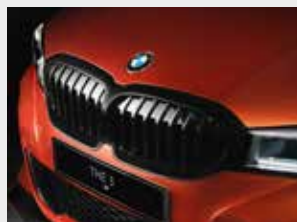
Kidney Grille in High-Gloss Black