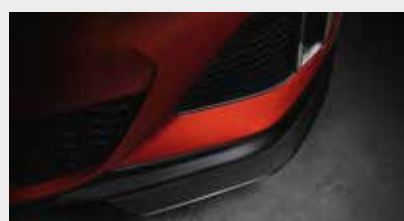
Front Splitter Pro in Carbon Fibre