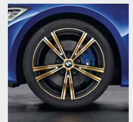
19" 793 M Light Alloy Wheels in Night Gold, Burnished