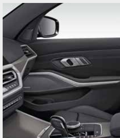
Harman Kardon Surround Sound System