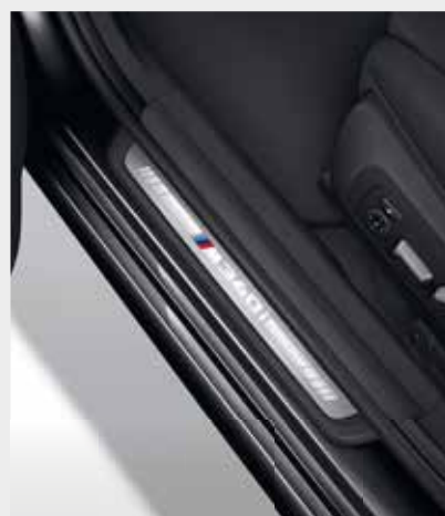
M Specific Door Sill