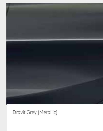
Dravit Grey (Metallic)