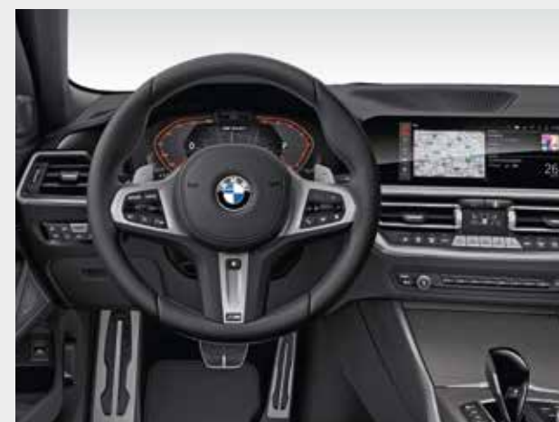
Variable Sport Steering