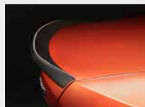
Rear Spoiler in Matt Black