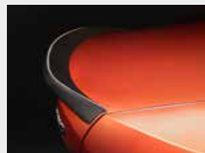
Rear Spoiler in Matt Black